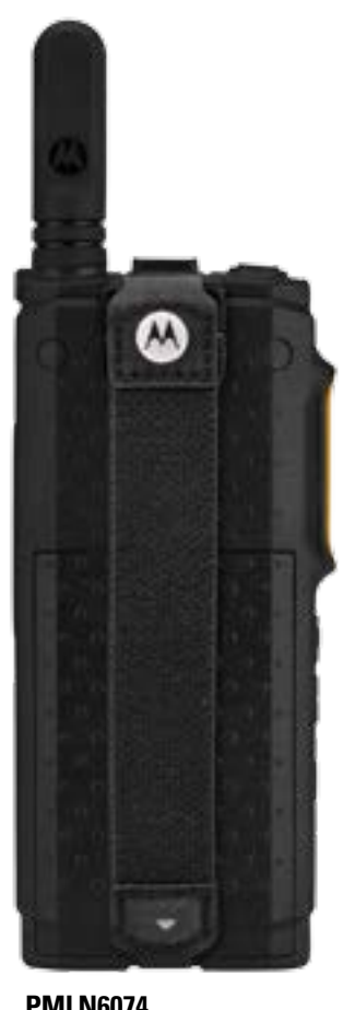
PMLN6074 Nylon Wrist Strap