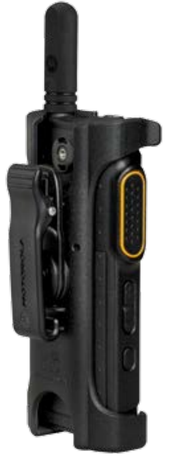
PMLN7190 Carry Holder/Holster with Swivel Belt Clip

By spending countless hours in the field with customers, we've developed accessories that aren't just the most innovative. But also the most useful.